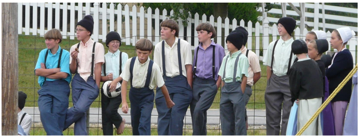
Amish children at the Northside School in Shipshewana, Fall 2013.